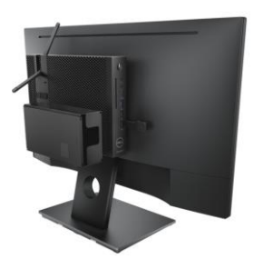
WYSE 5070 BEHIND THE MONITOR MOUNT FOR E-SERIES MONITORS

Optimize your dual monitor setup to improve productivity and reduce desktop clutter.