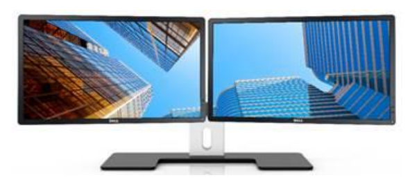
DELL 24 MONITOR P2417H WITH DELL DUAL MONITOR STAND | MDS14A

Optimize your dual monitor setup to improve productivity and reduce desktop clutter.